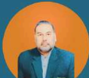
Deputy Director (Admin & Operation)