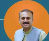
Deputy Director (Finance & Planning)